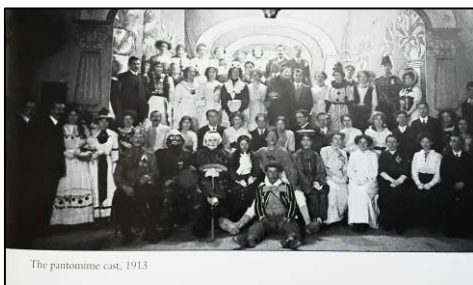
The pantomime cast, 1913

We were most disappointed having to cancel our recent spring fete fundraiser. These events are very important for us to put some funds in the bank so we can stage the next show. We're hoping to arrange another date during the summer and look forward to enjoying a nice sunny day to launch our little yellow ducks into the river! We hope you are able to come and support us next time.